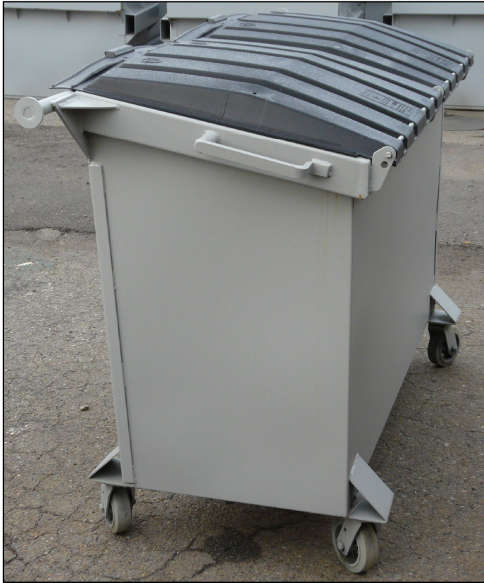
Manufactured by STI, Inc.