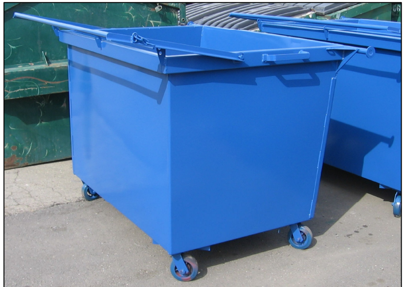
Manufactured by STI, Inc.